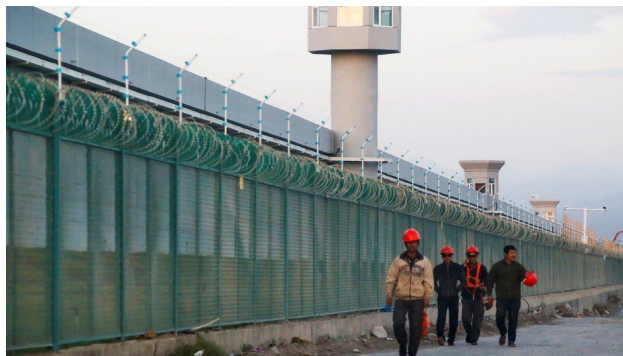
China has created a sprawling network of detention camps in Xinjiang.

In the early 20th Century, the Uyghurs briefly declared independence for the region but it was brought under the complete control of China's new Communist government in 1949.