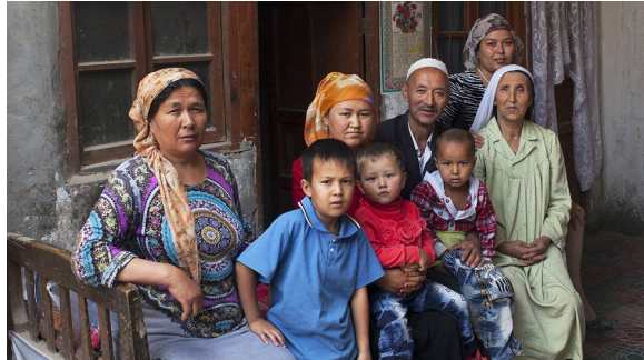
The Uyghurs are the largest minority ethnic group in China's north-western province of Xinjiang.

that would create an international precedent for weakening their own domestic sovereignty. 6