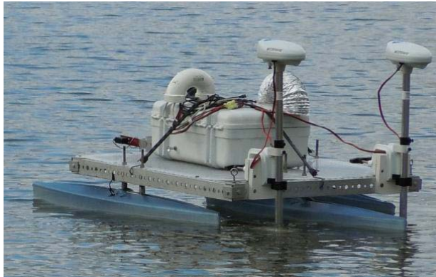
Figure 3. ODU ASV in Action