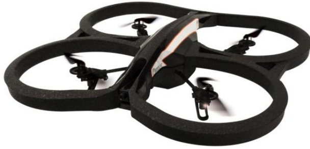
Fig. 2. Quadcopter for Target Searching