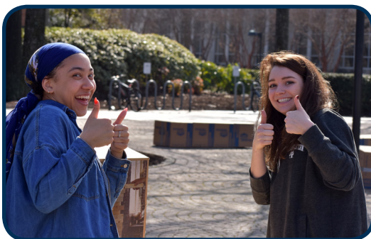
Students enjoy a friendly game of Jenga on the Kaufman lawn National Engineers Week.