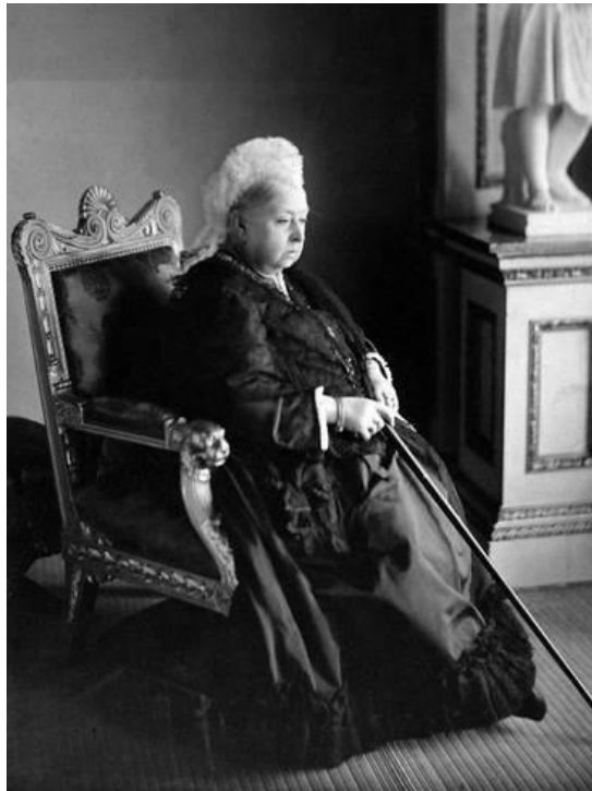
God save the Queen.

movement across their borders. Dracula was imagined as a symbol of the Victorian era's inability to cope the problems it helped unleash. Led by Europe's industrial revolution, the world was experiencing globalization for the first time. National borders, remote and difficult to cross for thousands of years because people were limited to walking, animal and wind transport, suddenly melted away, pushed aside by the spread of railroads and steam ships. The miracles of modern trade, communications and transportation seemed to change all aspects of daily life. Everyone bought goods that arrived by ship or train. Some travelled by train or steam ship. A few communicated by telegraph, or had seen public displays the newest miracle, the telephone .