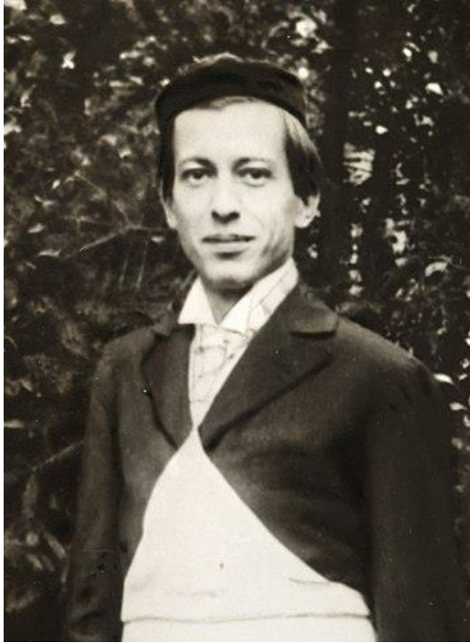
Nicolae Paulescu in Paris in 1897

Dr Nicolae Paulescu was a real Romanian physiologist, professor of medicine, and politician, most famous for his work on diabetes. Paulescu also was co-founder of the National Christian Union and later of the National-Christian Defense League in Romania. He was also a leading member of the Iron Guard, a nationalist movement. He has only local knowledge of Transylvania of anyone in The Society for Welfare and Hygiene.