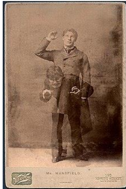
Actor Richard Mansfield originated the dual portrayal of Dr. Jekyll and Mr. Hyde in an 1887 stage adaptation.

Dr. Henry Jekyll , and his alternative personality, Mr. Edward Hyde , is the fictional protagonist of Robert Louis Stevenson's 1886 novel, The Strange Case of Dr Jekyll and Mr Hyde . In the story, Jekyll is a kind and respected English doctor who has repressed evil urges inside of him. In an attempt to hide this, he develops a type of serum that he believes will effectively compartmentalize his dark side. Instead, Jekyll transforms into Edward Hyde, the physical and mental manifestation of his evil personality. This dualism can give Jekyll great care and restraint, or enable Hyde's extreme combativeness. You appreciate Jekyll in a club meeting, but want Hyde in a fight.