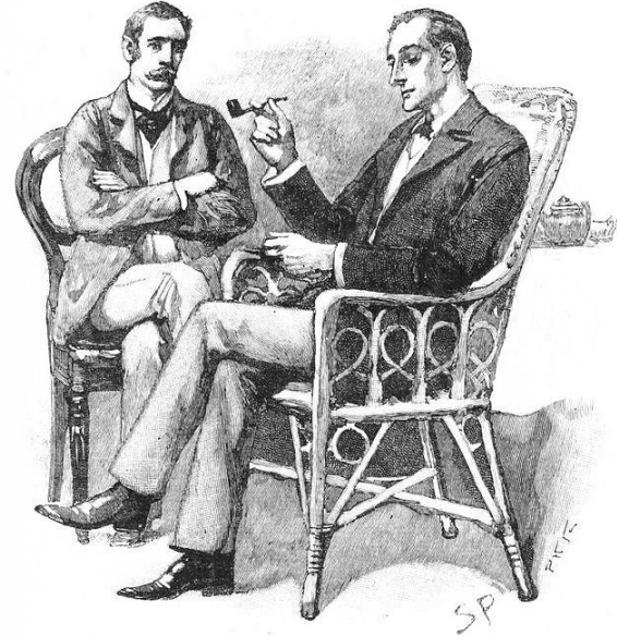
Mr. Holmes and Dr. Watson.

Dr. John H. Watson is a fictional character in the Sherlock Holmes stories by Sir Arthur Conan Doyle. Watson is Holmes's best friend, assistant and flatmate. Watson is described as a classic Victorian-era gentleman, unlike the more eccentric Holmes. He is astute and intelligent although he fails to match his friend's deductive skills. His detachment and reflectiveness lend a care and wisdom often missing in his more volcanic friend.