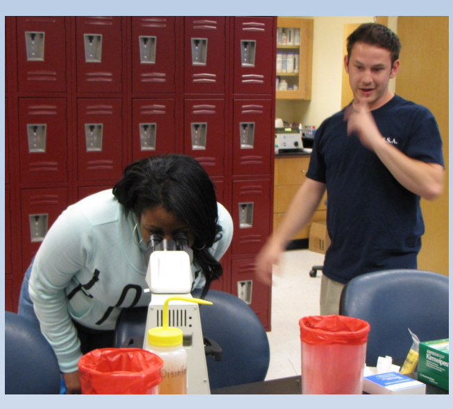
Admitted Students Day

• Hadeel Ayoub, "Fluorescence Technology Versus Visual and Tactile Examination in the Detection of Oreal Lesions: A Pilot Study"