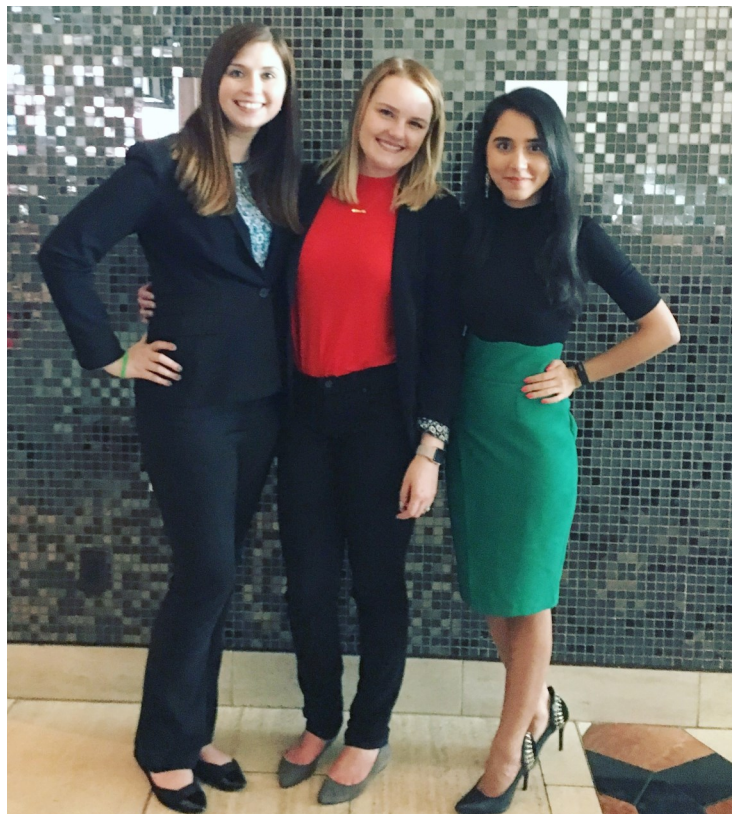
Three generations of ODU Doctoral Students/Alumni

“We outlined Sensory Processing Disorder, discussed the sub-types, and provided screening tools for counselors. There was a wonderful turn-out for our presentation and meaningful discussion that followed. We were very encouraged by the number of counselors committed to working with and advocating for children and adolescents with Sensory Processing Disorder.”