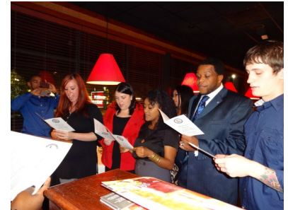
Inductees reading the membership pledge.