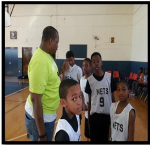
Above & below: Youth Basketball Association teams listening to their coaches during a basketball tournament in Newport News, VA.