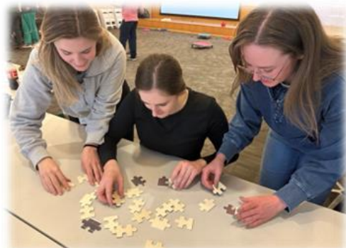
Emergency Medicine residents participating in the Mini Sono Games, February 2025.