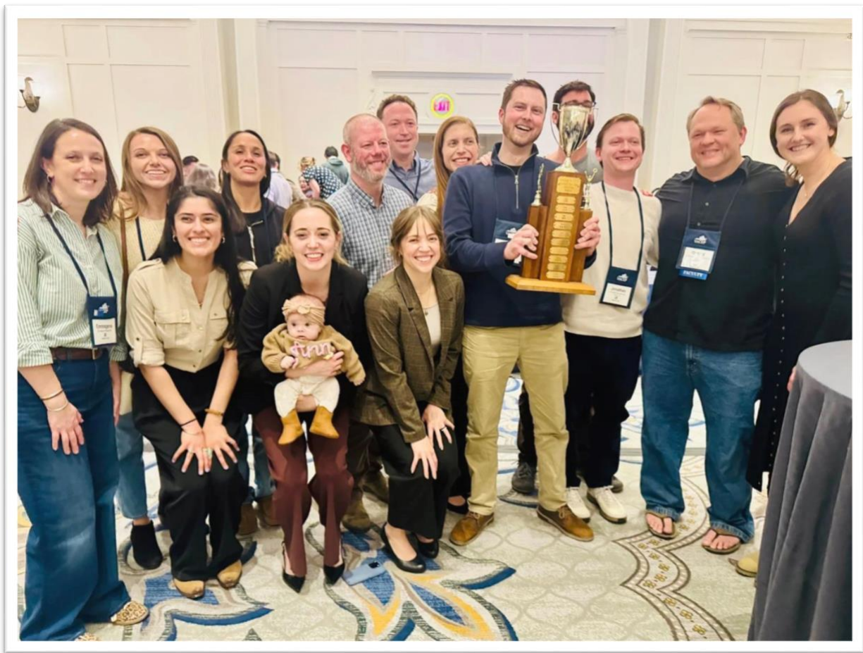
Team EM at VACEP 2026!