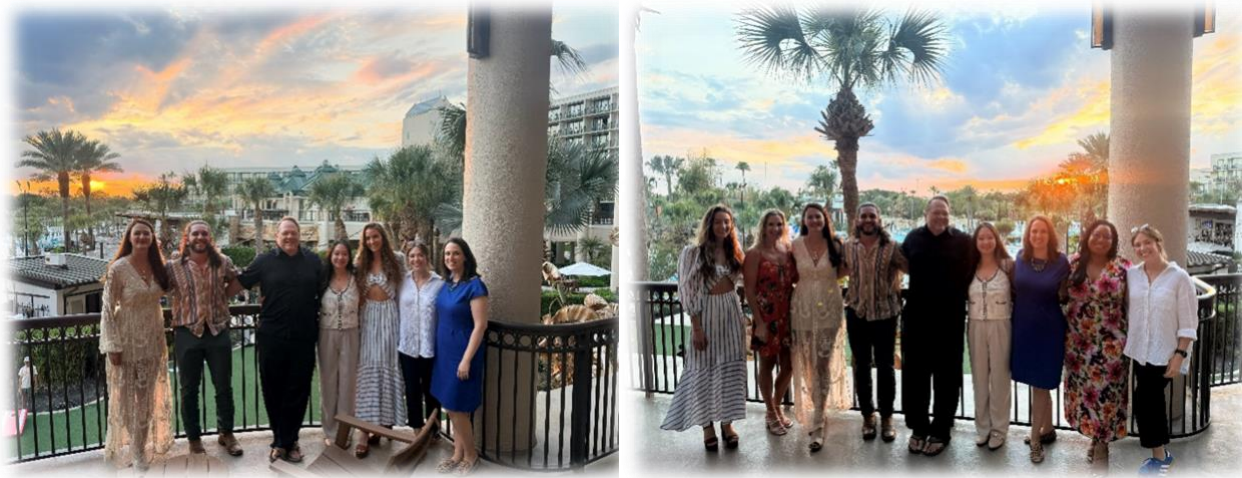
Faculty, residents, and coordinators at the Emergency Medicine Council of Residency Directors (CORD) meeting in Orlando (4/26).