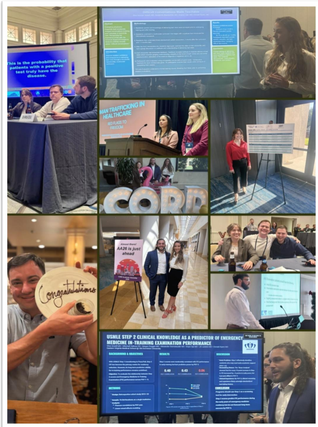
Team EM during VACEP and CORD 2026