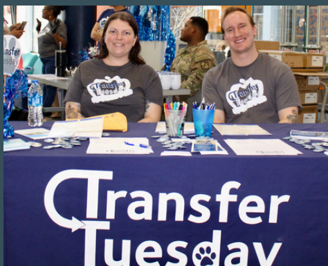
Transfer Tuesday Fun!