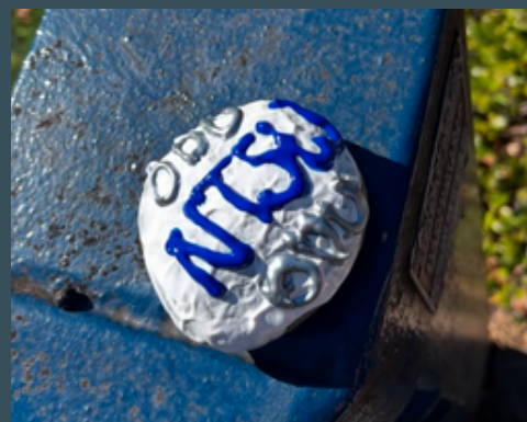
"Paint Your Rock" Transfer Event