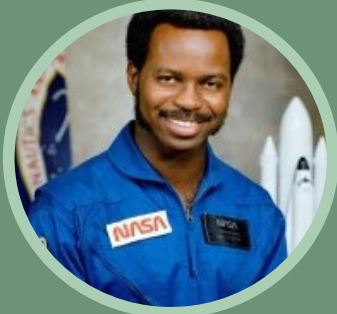
Dr. Ronald E. McNair