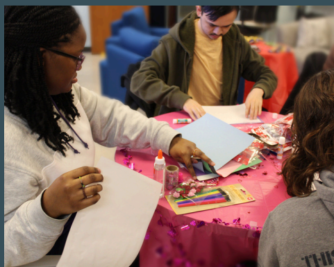
Tau Sigma Members Decorating Valentine's Cards