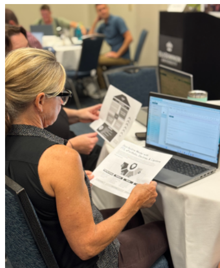
Reform Committee members develop potential new models at the General Education Retreat on August 12.