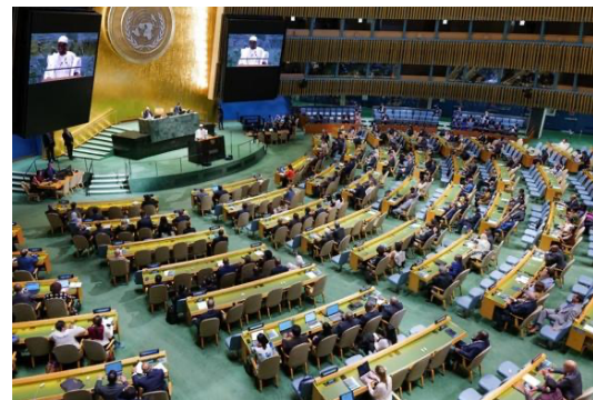
Where it happens: the UN General Assembly

Around the world, 61 million children do not attend primary