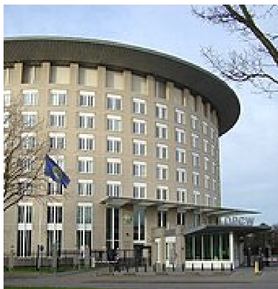
Headquarters of the Organization for the Prohibition of Chemical Weapons (OPCW), the independent

The history of attempting to control chemical weapons dates back to the 17th Century. The Strasbourg Agreement of 1675 brought states together to ban the use of poison bullets. 19 Later, the Brussels Convention on the Law and Customs of War of 1874 and the aforementioned 1899 Hague Peace Conference outlawed the deployment of poisoned weapons. 20 These agreements centered on controlling chemicals released by projectile weapons. By the First World War, technology had improved enough to release chemicals from pressurized cylinders to cover the battlefield in a deadly haze. As far as international agreements were concerned, the letter of the law was upheld while its spirit had been broken.