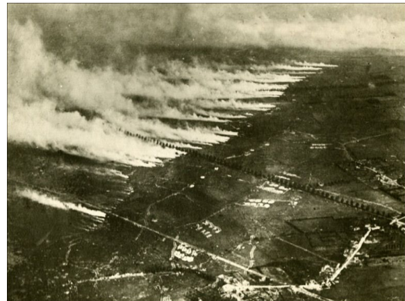
Aerial photo of a gas attack along the Somme River, France.

to peaceful purposes, 30 percent of the 8.6 million chemical munitions covered by the CWC have been verifiably destroyed, and almost 25 percent of the world's declared stockpile of approximately 71,000 metric tons of chemical agent have been verifiably destroyed. Since April 1997, the OPCW [Organization for the Prohibition of Chemical Weapons, the independent agency implementing the treaty] conducted 2,800 inspections at 200 chemical weapon-related sites and over 850 industrial sites in 77 States Parties. 1