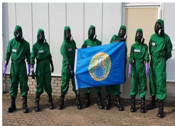
OPCW inspectors with the organization's flag

Convention and, in particular, shall abide by the provisions set forth in the Confidentiality Annex. 26