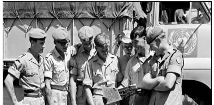
Figure 2: UN Peacekeepers in one of their earlier missions Cyprus (UNFICYP) 1967

operations, they are located in Western Sahara (MINURSO), Liberia (UNMIL), Cote d'Ivoire (UNOCI), Sudan (UNAMID & UNISFA), Democratic Republic of the Congo (MONUSCO), South Sudan (UNMISS), Mali (MINUSMA), the Central African Republic (MINUSCA), Haiti (MINUSTAH), Kashmir (UNMOGIP), Cyprus (UNFICYP), Kosovo (UNMIK), Lebanon (UNIFIL), and Golan Heights in Syria (UNDOF) 7 .