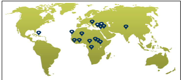
Figure 1: Locations of all ongoing peacekeeping operations

Generally speaking, peacekeepers are the main force through which a peacekeeping operation upholds ceasefires in host states. A peacekeeping operation involves military, police, and civilian