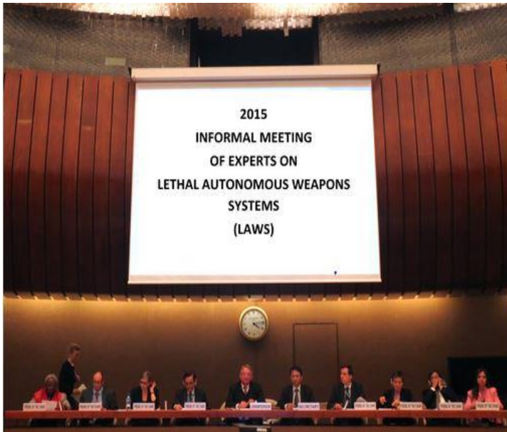
The dais for the Informal meeting on LAWS April 13-17 2015.

positive ways. LAWS could be deployed and programmed for a variety of different wartime services, including the protection of civilian centers and other humanitarian tasks. LAWS could be used as a truly neutral party to a conflict used to keep warring parties in ceasefire 6 .