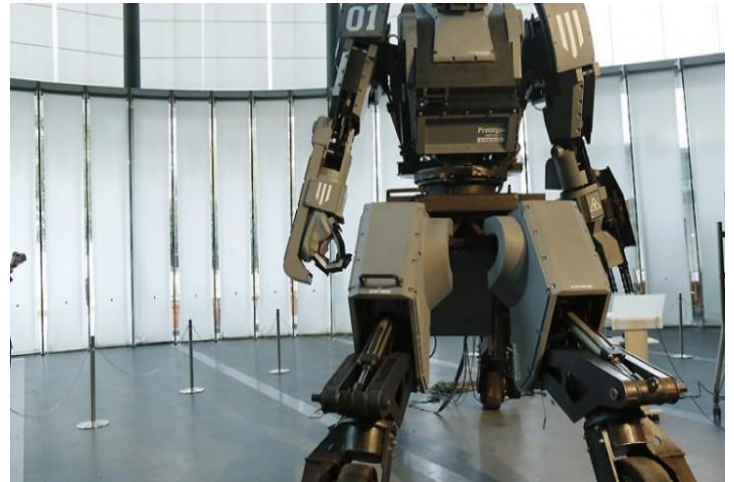
An example of a possible Autonomous Weapon

The US department of defense defines autonomous weapons systems as “a weapon system(s) that, once activated, can select and engage targets without further intervention by a human operator.” 1 This would be entirely unique machinery, and as far as is known presently, no such weapon is considered battle-ready. However, the development of these weapons has been