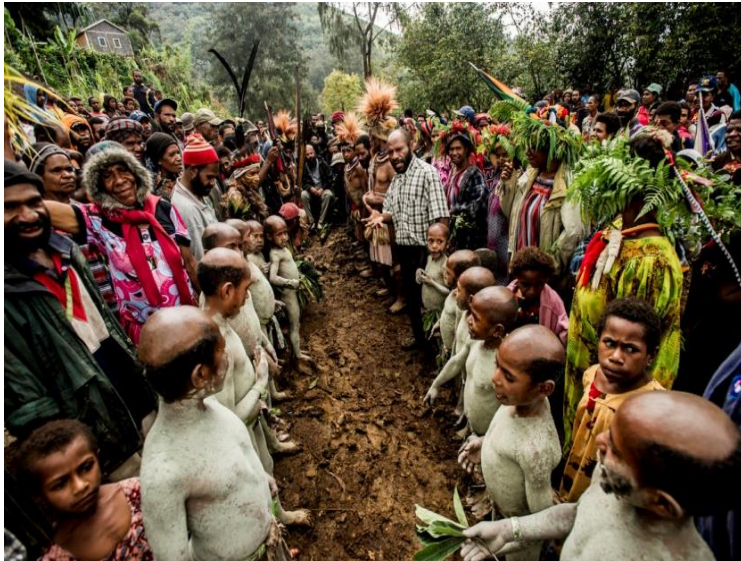
Thomson Harokaqzeh, then Papua New Guinea's Minister of the Environment (seen in the center) is greeted by a tribe in Papua New Guinea.

from learning to shoot a bow and arrow to tribal warfare within a four month time span.