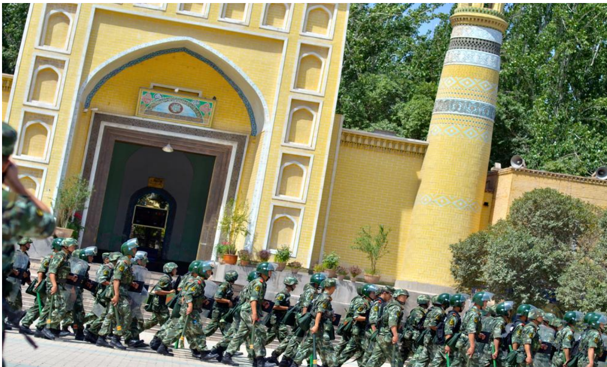
This picture shows both the considerable difference in architecture and religion in this region with the mosque in the background, and the Chinese government's response in the foreground with its increased police and military presence in Xinjiang province.

the mainstream Chinese Han culture. Since China's original control over Tibet during the Qing dynasty (a Manchu nation controlled government), and into the PRC's conquest of Tibet in 1950 (the modern Han dominated government), the Chinese government has sought to replace local Tibetan culture, mainly its religion and language, with that of the ruling culture 7 . Similar practices are being carried out in China along its western border in the province Xinjiang. Here the Uyghurs (pronounced weeger in English phonetics), a