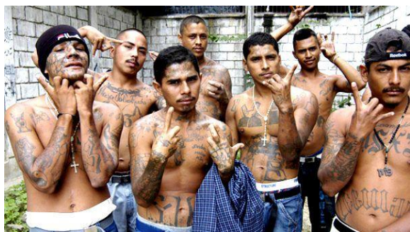
Gang members in El Salvador

Reducing gangs and the impact of lives requires international collaboration. Through globalization, illicit trade and migration, gangs have become a multi-national phenomenon. They often rely on family, neighborhood and ethnic relationships to build cross-country connections, gaining opportunities for enrichment, and spreading their pathologies. While most states prefer to respond to gang problems alone, using their own resources, sovereign action may be ineffective or even counterproductive, making gang problems worse, or pushing them to other countries.