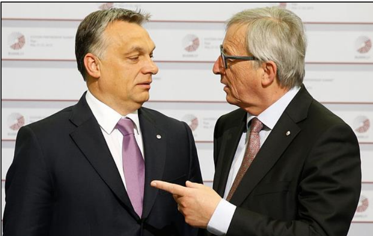
A meeting between Hungarian PM Viktor Orban (Left) and EU President Jean-Claude Juncker (right) in June 2015 to discuss Hungarian pro-death penalty proposals in the Hungarian National Assembly, against EU law.

Despite the United States preserving their right internationally to invoke the death, within its borders there is a movement of abolition brewing. Executions are declining at an exponential rate, with only 35 executions in 2014. The growing opposition for the death penalty in the United States is due to a number of contributing factors. Firstly, there have been 321 exonerations of individuals wrongfully convicted and executed for crimes of which through DNA evidence they were found innocent. This information on the flawed application of the death penalty played to reinforce the United Nation's concern of the irreversible and permanent nature of the punishment, by extension largely shaping the U.S. citizen's public opinion. Another predicament guiding the public stance on the death penalty is how costly the sentence is on tax payers. It is not enough that the United States of America has the highest incarceration rate per capita in the world, but the Due Process rights namely, the right to appeal, makes the death penalty a literal money pit for tax payers. 18 Research shows