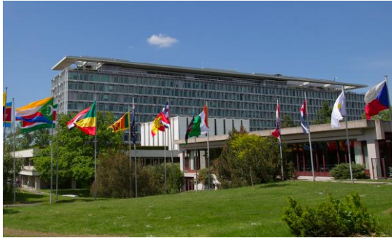
WHO headquarters in Geneva

WHO is the revised Zika Strategic Response Plan which was put forth in June of 2016.