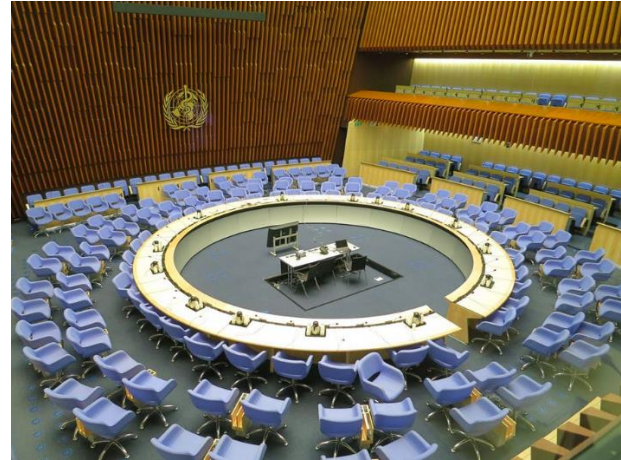
The WHO's Executive Boardroom, Geneva. The 34-member Board meets yearly in May. It appoints the Director-General every five years

The Zika virus is spread by daytime-active Aedes species mosquitoes. The disease has been known since the 1950s, originally in a narrow equatorial belt in Africa and Asia. In 2007, the virus began to spread eastward, across the Pacific Ocean to the Americas. It was in the Americas that it reached epidemic proportions, culminating in the 2015-16 Zika epidemic which garnered global attention.