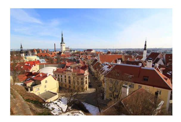
UNESCO World Heritage Site: Old Town, Tallinn, Estonia

Presently 193 states parties have signed the Convention. Of the 193 signatories, 189 of these are UN Member States. Among non-state members, Palestine is the most controversial. Only four UN member states have not ratified the Convention: Liechtenstein, Nauru, Somalia and Tuvalu.