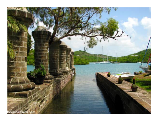
UNESCO World Heritage Site: Naval Dockyard, Antigua and Barbuda

Lobbying: The World Heritage List is widely considered to be a huge success in regards to its intended purpose of protecting and preserving important cultural and natural sites. However, it has also been successful in a less intended way. A sizable lobbying industry has grown around the awards because World Heritage listing has the potential to significantly increase tourism revenue in connection to the sites selected.