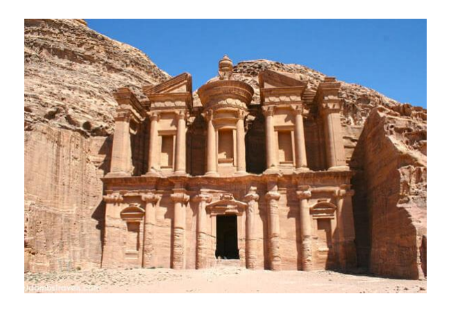
UNESCO World Heritage Site: The Monastery, Petra, Jordan

Territorial issues can create an especially strong incentive to politicize heritage issues. Rival states and non-state groups use UNESCO as a way to establish control over territory. When two states or people's claim the same site, conflict is unavoidable. Conflicts where heritage sites are involved include India-Pakistan, Israel-Palestine, Kosovo-Serbia and Ukraine-Russia (over cites in Russian-occupied Crimea). As a result, UNESCO is a tension-filled organization, the scene of many of the United Nation's most bitter disputes.