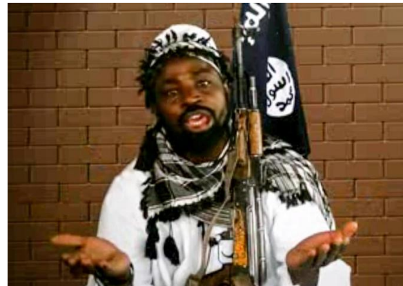
A screen grab from a video released on 2 January 2018 showing Boko Haram leader Abubakar Shekau amid a surge in violence casting doubt on the Nigerian government's claim that the militant group is defeated.

April 2018 Boko Haram has kidnapped more than 1,000 children in the last five years, according to UNICEF. UNICEF also asserts that one in five suicide bombers employed by Boko Haram are children.