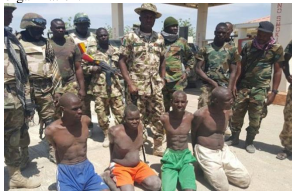
The Nigerian Army arrest four Boko Haram extremists in 2016.

November 2013 the United States has officially designated Boko Haram as a terrorist organization.