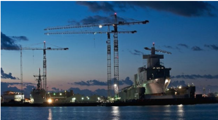
The Norfolk Naval Shipyard as seen from the Sheraton Norfolk Waterside Hotel, and the nearby WWII battleship USS Wisconsin.

ODUMUNC is delighted to welcome faculty back to our Faculty Forum , a one-day seminar on international affairs with maximum classroom relevance. This year's Forum marks the 75th anniversary of the founding the North Atlantic Treaty Organization (NATO) in 1949. The Forum, on Saturday 17 February, features ODU professors and NATO officials discussing the future of the world's dominant military alliance. ODU offers Continuing Education credit for the Faculty Forum.