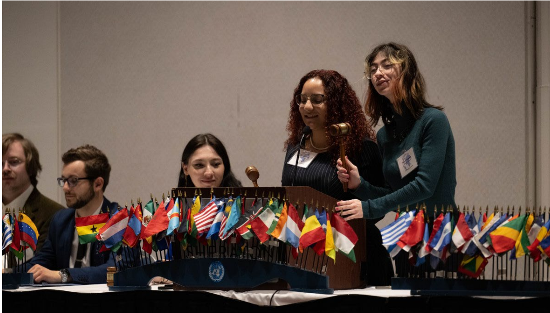
Opening ceremony at ODUMUNC 46, February 2023

At the conference, delegates promote their countries' policies, guided by leadership from ODUMUNC's experienced staff, using parliamentary rules and diplomatic practices to achieve their delegation's goals.