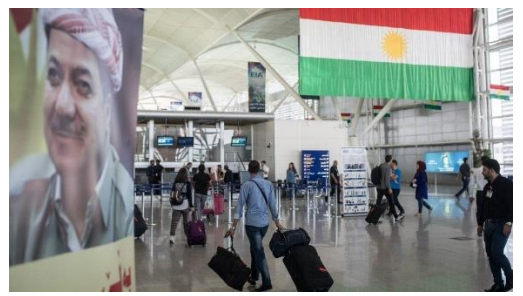
Mr Abadi has demanded that his government be given control of Irbil international airport.

Iraq's Kurdish region foreign affairs minister says independence is 'inevitable'