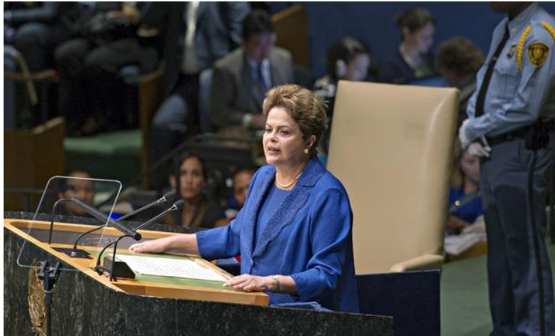
Dilma Rousseff, president of Brazil, told the general assembly ‘we must be ambitious’ when it comes to helping the least developed countries.