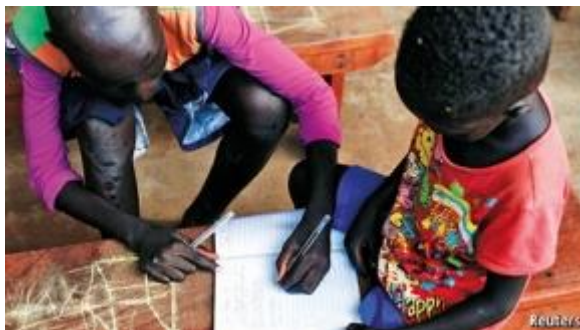
Education, education, education

Some attempts will be made to increase the number of goals (and targets). But the real battle in 2015 will be over whether to have fewer. A group of rich governments, including America and Britain, plus some business leaders and philanthropists such as Bill Gates, would prefer a smaller set of crunchier goals, with an emphasis on building on and completing the work of the MDGs. For them, trying to agree on a goal for, say, income inequality has the potential to be a massive distraction from the practical issues of helping the people now worst off. Developing countries, on the other hand, and in all likelihood the leaders of the UN, will push for a broad package of goals and targets that has the potential to transform the workings of the international economic and political system.