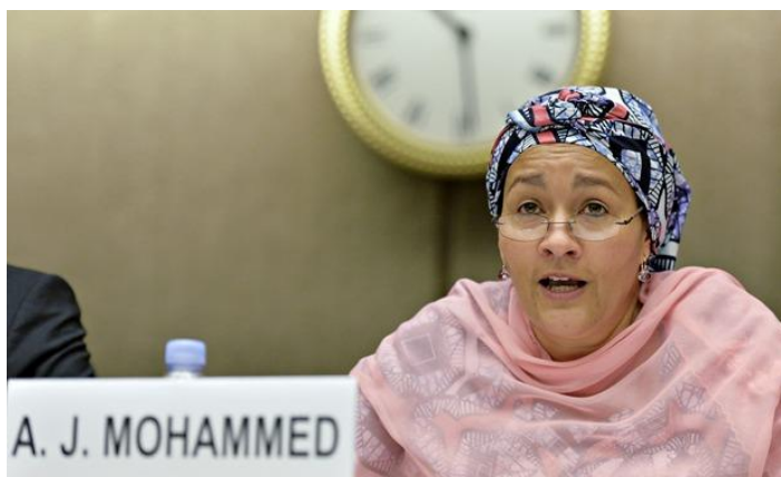
Amina Mohammed, special adviser of the UN secretary general on post-2015 development planning, said: 'It will take a lot of leadership, and courage will be required' to achieve the sustainable development goals.

"There's lots of pressure. People have fought very hard for these [17 goals] and they don't want them touched, but we don't want to fall into the trap of being too prescriptive. We've got to have conversations that will continue to shape up the goals, get more clarity, more commitments that reflect local reality," she told the Guardian. "It will take a lot of leadership, and courage will be required to take the body blows for this."