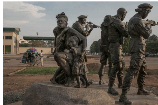
A statue honoring Wagner Group mercenaries in Central African Republic (CAR).

While the headlines are dominated by the organizations that cause the most international disruption or become infamous for specific activities or crimes, there are innumerable private security firms in the world. Most do nothing more controversial than patrol business and neighborhood. They outnumber the police and armed forces in many countries. The private security industry employs tens of millions of people world-wide. For example, in South Africa alone, the private security industry includes 10,380 registered companies and over 2.5 million registered security guards. 9 Besides Wagner, here are some of the best known: 10