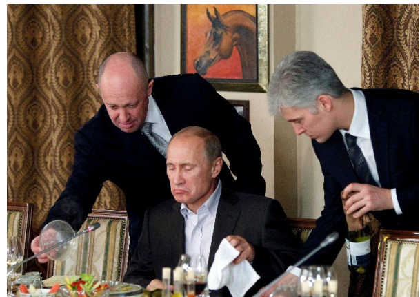
Wagner leader Yevgeny Prigozhin serves then-Russian Prime Minister, today Russian President, Vladimir Putin in 2011.

Many observers agree the ECOSCO is well positioned to take up the issue again. Its member States are increasingly interested in generating momentum for progress, especially now that the nature of the mercenary problems has changed greatly. Action slowed in the 2010s, as the American and British firms that dominated the scenes lost importance and visibility. Now the problem is symbolized by the extensive disruption of the Russian Wagner company, with effects felt in Africa, Europe and the Middle East.