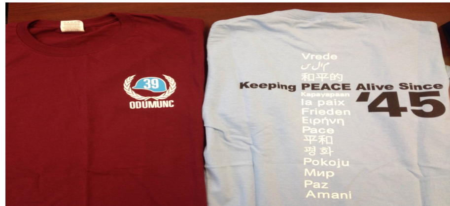
They're red hot, or they're not: T-shirt front and back, featuring the United Nations logo and Monarch lion, hand drawn by one of our own ODUMUNC club members.

For more information about ISOC see: https://www.causes.com/causes/379221-in-support-of-children-it-s-never-ok-to-hit-a-child/about