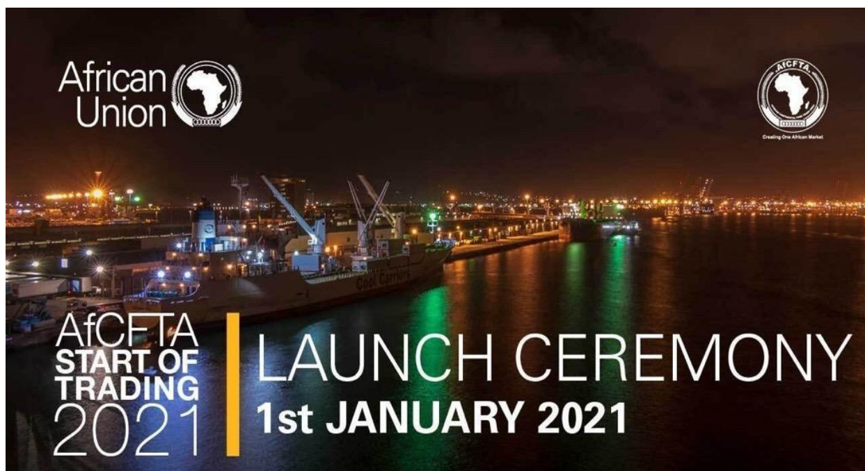
Figure 3: Official Start of Trading under AfCFTA, https://au.int/en

The United Nations has been notably present in Africa since 1960, a year which saw 15 African countries gaining independence and 17 new States admitted to the United Nations, 16 of which were from Africa. This was also the year when the General Assembly adopted the Declaration on the Granting of Independence to Colonial Countries and Peoples, esteeming the right to self-determination and decolonization. The UN has continued to work closely with Member States concerned and regional organizations, such as the AU and ECOWAS in peace keeping missions and crisis response. 19