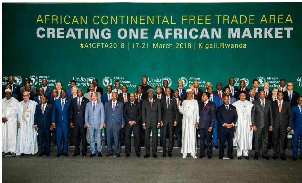
Figure 1: African Heads of State

Only in the 1960s, as colonial rule collapsed and the territories of Africa became independent states, was economic cooperation possible. But old habits and new rivalries continued to make cooperation difficult for decades. Many regional organizations were created, but none performed as hoped.