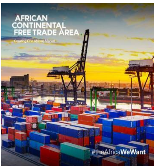
Figure 2: Creating one African Market, https://au.int/en

Progress toward a single African market began in July 1979, at the 33rd Ordinary Session of the Council of Ministers of the Organization of African Unity (OAU) - now AU - which was held in Liberia. It was at this Session that the Monrovia Strategy for Economic Development of Africa was adopted. This strategy marked an integral part of the African Development Strategy for the Third Development Decade because it called upon the OAU, the Economic Commission for Africa (ECA), regional institutions and appropriate international organizations to 'ensure the implementation of the recommendations of the Colloquium on Perspectives of Development and Economic Growth in Africa up to the year 2000.' 4