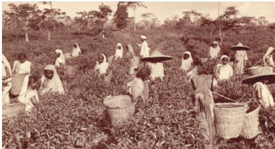
Indentured servants work on a tea plantation in India. 8

Yet the achievement of independence did not bring an end to the unequal economic, social and political structures that were established under colonial rule. Since the local economies of many postcolonial states had been completely reoriented to the export of raw materials under colonialism and with little or no industrial infrastructure, many states struggled to build independent economies that would enable them to flourish as the former colonial powers had. For instance, one economist has estimated that prior to colonization, India's productivity represented 27 per cent of the world economy, but after British colonization this plummeted to a mere 3 per cent of the world total. 7