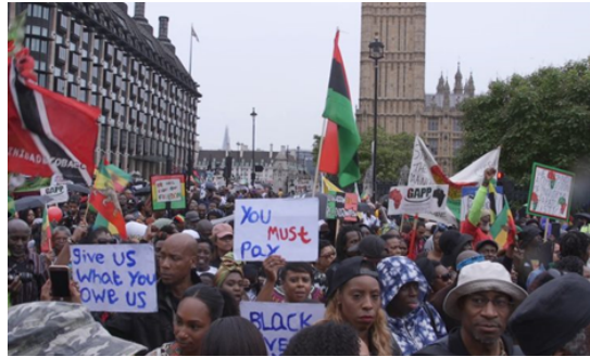
Protestors demanding reparations for African states outside of the British House of Parliament. 23

Despite these challenges, many postcolonial states and groups within states continue to press former colonial powers to issue reparations. Direct state-to-state or group-to-state negotiations are seen as the most effective means of pressing the reparation agenda. For instance, a recent case that was heard in the British High Court has led to reparations for a group of 5,000 Kenyan elders who were tortured under British colonial rule. 24 It is often easier to bring a case to the domestic court system of the former colonial power than trying to navigate the complexities of the international system which may not even lead to a binding ruling.