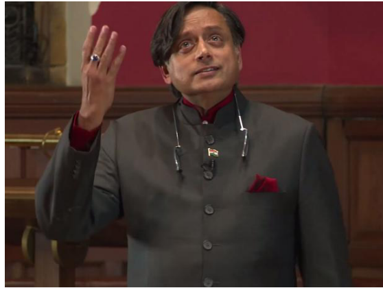
Dr. Shashi Tharoor, an Indian politician, calls for colonial reparations at the Oxford Union. 20

In recent years, the international organization of fifteen Caribbean states, CARICOM, took a leading role on the issue of postcolonial reparations.