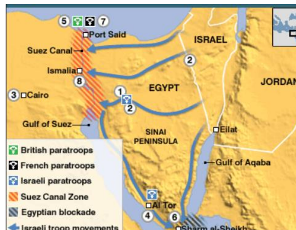
The 1956 Suez Crisis

lightly armed, designed to force adversaries apart, but to monitor the peace. They were armed only for self-defense, and not expected to do that often.