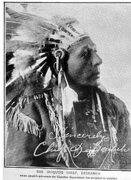
Newspaper photograph of Deskaheh, 1 January 1922.

In the United States, Wilson was heard by Haudenosaunee Chief Deskaheh (of the Tuscarora Reservation, New York), who travelled in 1923 from the United States to the League of Nations in Geneva (predecessor of the UN) to 'defend the right of his people to live under their own laws, on their own land, and under their own faith.' 5 He was turned away by the League—where the US refused to allow him to speak—but began a struggle for indigenous recognition and self-rule that continues to this day. 6