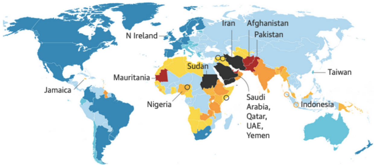
Guardian graphic