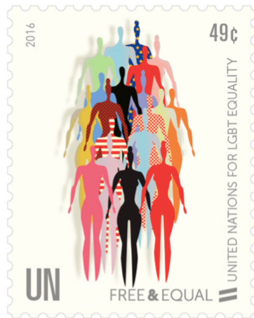
One of six stamps issued in 2016 by the United Nations Postal Administration (UNPA) to promote the UN Free & Equal campaign for lesbian, gay, bisexual and transgender (LGBT) equality.

in this Declaration, without distinction of any kind.’ 2