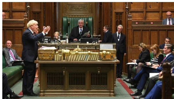
Prime Minister Johnson tries his best in the Common, September 2020. 2

Though quite sure his chances at one day gaining the Premiership were as likely as him being "reincarnated as an olive," those chances grew immensely after his resignation from the Theresa May Cabinet over her Brexit plans, and especially after Theresa May's resignation from the Premiership.