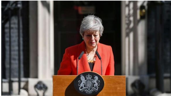
Rough day: Prime Minister Theresa May Resigns as premier on 7 June 2019

Brexit deals negotiated under the Premiership of Boris Johnson signaled a clear and apparent change to Members of Parliament and the British Populace, that getting Brexit done no matter the cost was the priority. Emboldened with the public's feelings of anger or inaction, the negotiating process under Boris Johnson switched from that of finding an acceptable compromise for all, to utilizing political statecraft and other loopholes to force a deal through. Bearing striking resemblances toward the deals negotiated under Theresa May's Premiership, Boris Johnson took advantage of the political chaos left in the wake of the previous general election. Playing upon unknowing advantages given to him by Labor inaction and infighting, Boris Johnson gained the ability to push a Brexit deal through before the opposition could react. Although the long-term impacts of his deal have yet to be seen, many are left wondering how the nation might look in the coming years.