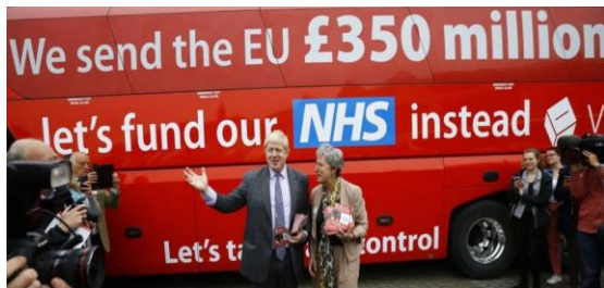
Boris Johnson's famous 2016 Brexit campaign bus, with its emotionally compelling, and factual dubious slogan

other fees associated with international trade, the European Single Goods Market was meant to be a tool to bolster member nations economies, and yet in the eyes of Pro-Brexiteers, the opposite was occurring. As other member nations gained the ability to freely trade with the United Kingdom, Pro-Brexiteers saw this influx of international trade unfavorable and harmful to domestic industry and interests. Many felt leaving the European Union and its Single Goods Market would see a return to the rise of domestic industry and economic growth.