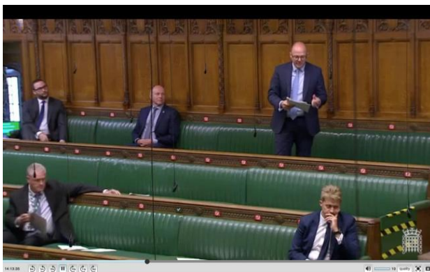
Social distant House of Commons 1

Although the news of an Brexit agreement between the United Kingdom and the European Union would bring joy to the hardline Brexiters in Parliament, overwhelming criticisms over the finite details of this arrangement led to calls for a new Government, a vote of no confidence, and the resignation of several Members and Secretaries of Parliament. Undeterred by a vote of no confidence in her own party and bolstered by the EU's endorsement of the Withdrawal agreement, Theresa May pushed forward with introducing the agreement as a bill to be voted upon in Parliament. Unfortunately for Theresa and her Government, the original withdrawal agreement failed with an overwhelming majority of 432 Members of Parliament voting against the proposed agreement, the largest defeat of a Prime Minister in history. Theresa May and her Government would push forward twice more with their attempts to settle a Brexit deal, both times resulting in a failure to gain the support and consent of Parliament. On the heels of her third and final defeat in Parliament, Theresa May resigned as Prime Minister citing her inability to gain Parliament's favor, ultimately paving the way for new Conservative leadership to push the United Kingdom through the finish line.