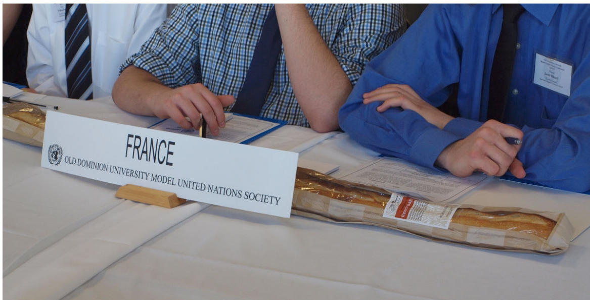
Hungry? No problem! France brought plenty of bread for breaking to Security Council.