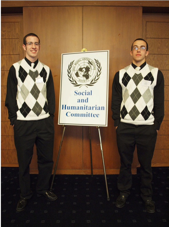
SOCHUM brings a new meaning to "double delegation".