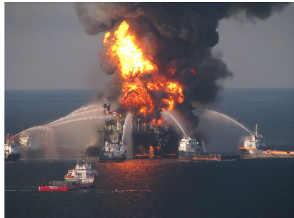
Arctic Sequestration Rig Explosion 2040

On 14 July 2040 the Norwegian Arctic Carbon Sequestration Rig experienced a massive explosion. The explosion footage was analyzed by Norwegian authorities and it was suspected to be an autonomous explosive weapon due to the amount of damage caused to the structure. The next week a portion of a submersible’s front cone was discovered and was suspected to be a portion of the weapon. The materials of the cone are being analyzed for their origin but accusations are already flying.