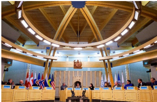
The Arctic Council in session

All is not lost. The cost competitiveness of solar and wind technologies has made the expansion of oil and gas power unfeasible for all but the least developed countries. In addition, the nuclear power plants built out in multiple ongoing expansion programs are starting to come online. This has driven a crash in the carbon emissions of western and Asian nations. If these technologies are spread to less developed nations a path toward a stable climate future is possible.