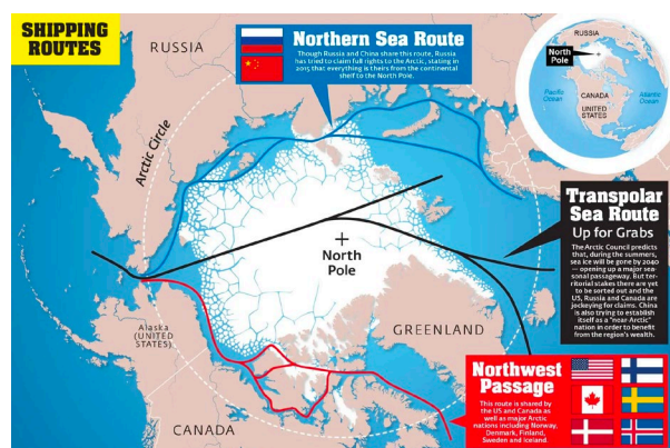
2040 Transpolar Sea Routes

The power of the body to enforce decisions, agreements, and resolutions passed is limited. 2 It has no authority over its members, sovereign states, and relies on their voluntary participation in the process and acceptance of its resolutions. If a Member State votes against a resolution, they are unlikely to uphold it. Any agreement or resolution from the body must keep this need for consensus in mind during the drafting process.