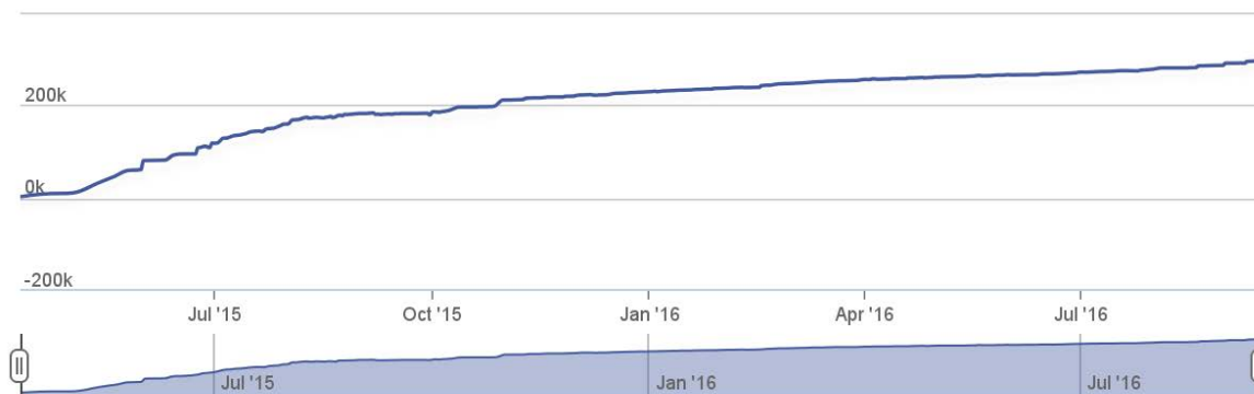
Figure 1 Burundian Refugees to Neighboring States since April 2015

Graduate Program in International Studies, Old Dominion University