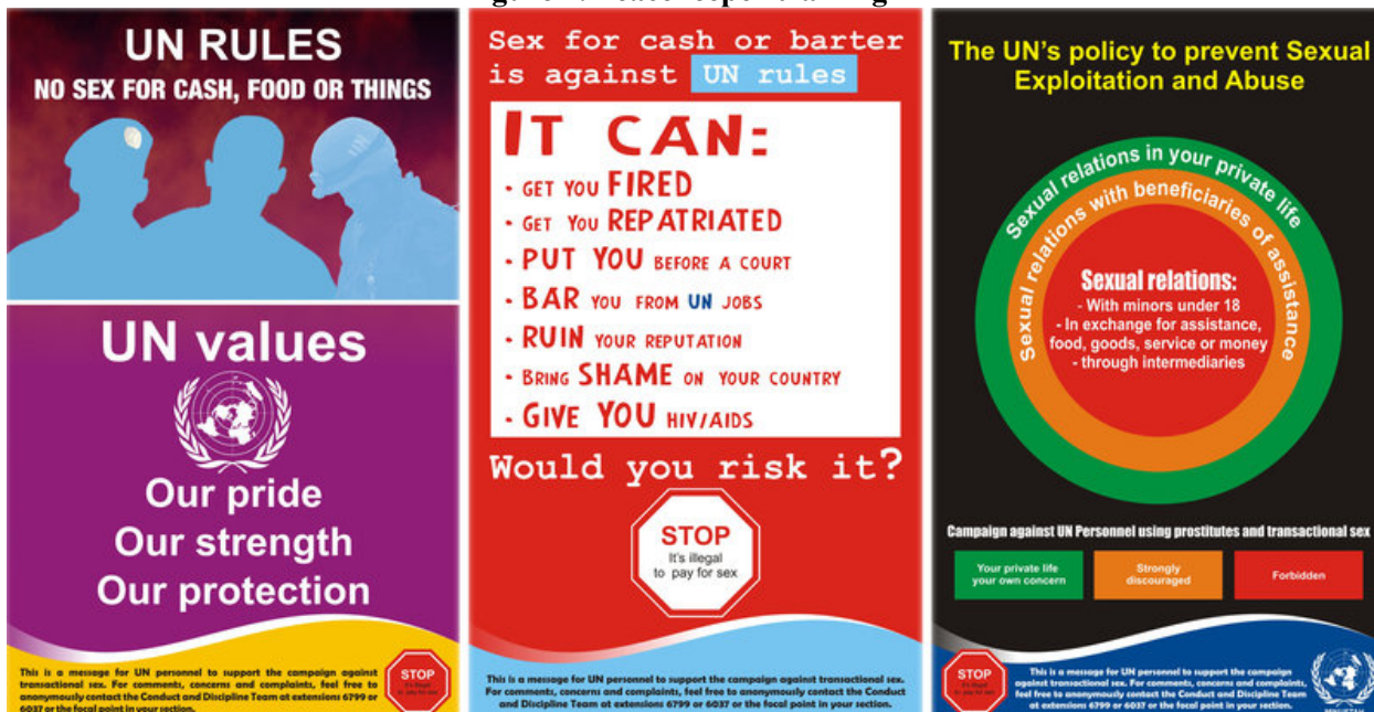
Figure 1. Peacekeeper training