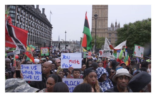
Protestors demanding reparations for African states

Despite these challenges, many postcolonial states and groups within states continue to press former colonial powers to issue reparations. Direct state-to-state or group-to-state negotiations are seen as the most effective means of pressing the reparation agenda. For instance, a recent case that was heard in the British High Court has led to reparations for a group of 5,000 Kenyan elders who were tortured under British colonial rule.<sup>16</sup> It is often easier to bring a case to the domestic court system of the former colonial power than trying to navigate the complexities of the international system which may not even lead to a binding ruling.