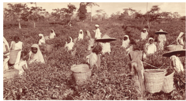
Indentured servants work on a tea plantation in India.<sup>8</sup>

Yet the achievement of independence did not bring an end to the unequal economic, social and political structures that were established under colonial rule. Since the local economies of many postcolonial states had been completely reoriented to the export of raw materials under colonialism and with little or no industrial infrastructure, many states struggled to build independent economies that would enable them to flourish as the former colonial powers had. For instance, one economist has estimated that prior to colonization, India's productivity represented 27% of the world economy, but after British colonization this productivity plummeted to a mere 3%.<sup>7</sup>