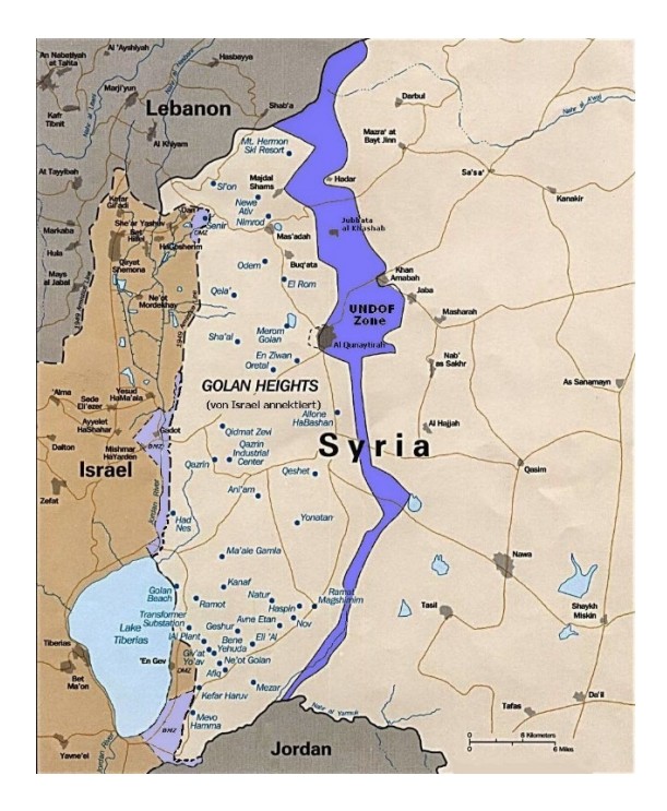
Tight spot: current UNDOF deployment in the Golan, separating the Israel and Syria militaries

A concern for UN action is the continuation of UNDOF, which increasingly is a target for attack from Syrian rebel groups. Sovereignty of the region is still under question, with the added immorality of awarding it to either side after both governments have had their actions regarding the region condemned by the UN. That ignores the fact that the UN cannot force a government into action with peacekeepers, and Israel will not back down despite international disapproval.