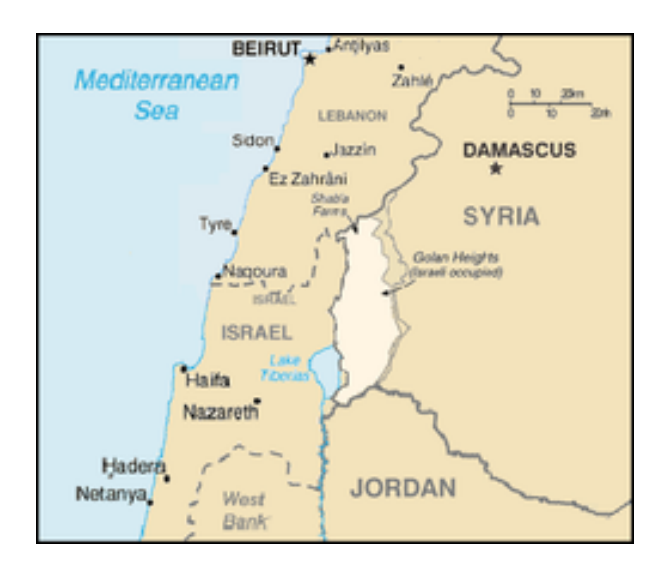
Since 1967: the Occupied Golan Heights.

Although pushed into the background by the horrors of the Syrian Civil War, the Golan dispute remains one of the most bitter in the egion, a major barrier to lasting peace in the Middle East. Resolving the Golan would eliminate a major hurdle to regional cooperation, including cooperation on issues of mutual interests for Israel and Syria, such as counterterrorism and natural resources sharing. It also remains a vital issue of principle for the Syrian Government and its many supporters in the United Nations. Solving the Golan dispute would be a major achievement, but it may not be possible. Reducing tensions may be ambition enough.