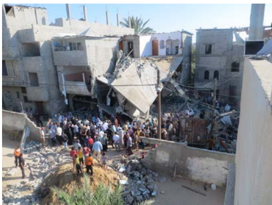
The Kaware' family home in Gaza, where eight people, including six minors, were killed, and from the Hamad family home where six members of that family, including one girl – a minor – were killed by Israeli bombing in July 2014.

Developing a common position is a key responsibility for the member states of the Arab League, with careful attention to measures that can be implemented without support from much of the international community, especially the inability of the UN Security Council to act effectively, due to continuous vetoes by the United States to protect Israeli war crimes. But the Arab League also must overcome its own internal divisions, between leaders to the Palestinian cause, and other member states trying to develop their own relations with Israel, or who believe recourses and energy should be focused on other issues, like wars in Iraq, Libya, Syria and Yemen, or social problems like lack of water and mass unemployment of Arab youth.