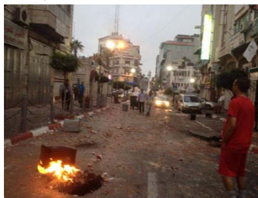
Scene in the temporary Palestinian capital of Ramallah after an IDF raid, June 2014.

have continued with little international scrutiny.