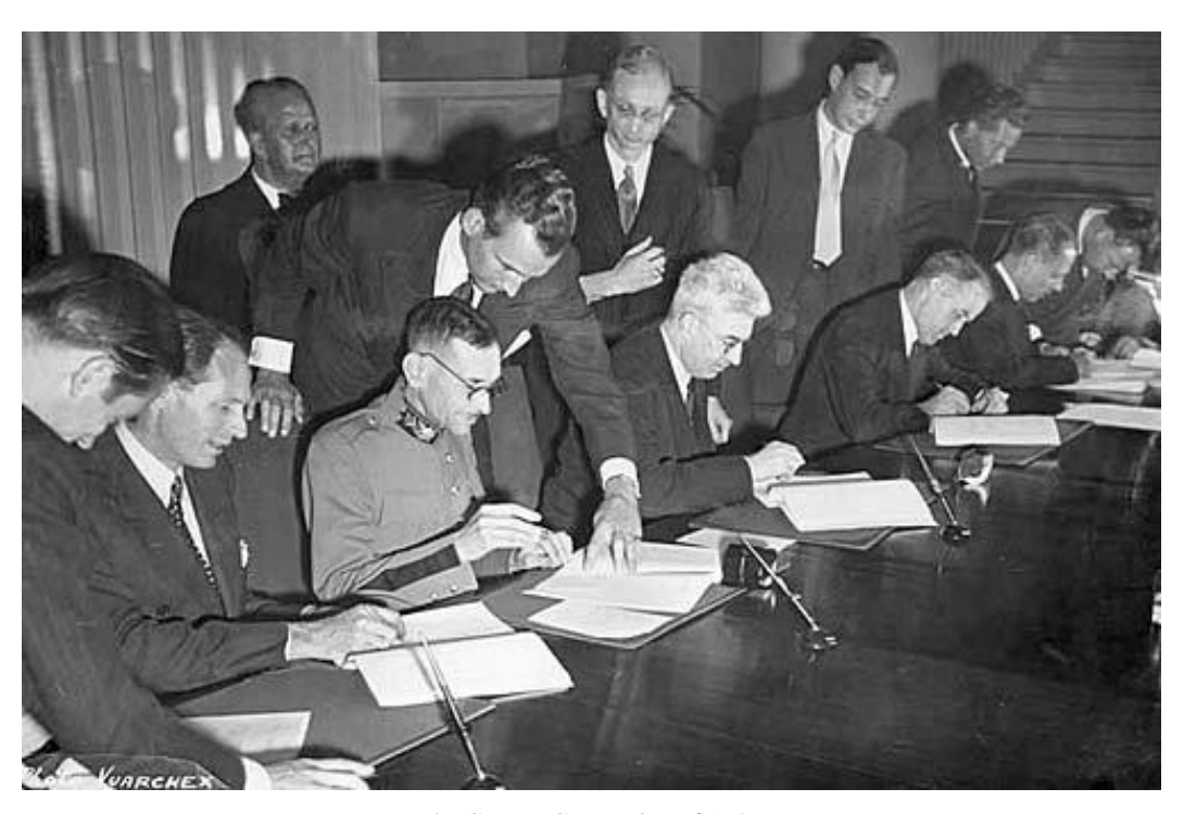
The Geneva Convention of 1949

The majority of the responsibility of maintaining and promoting the safety of journalists has been placed with the United Nations Educational, Scientific, and Cultural Organization (UNESCO). UNESCO has a wealth of information and statistics on the safety of journalists, and coordinates with prominent NGOs to promote journalist safety. The agency created a plan of action on the safety of journalists in 2012, which accounts for the safety of journalists both in wartime and in peace, one of the first UN documents to do this. The plan details specific protections to journalists that UNESCO would like to see progress, but this document is not a treaty. It is currently being implemented in five test countries to see if the plan works. The following are relevant UN documents concerning civilian/journalist protection (each treaty/resolution is hyperlinked to the full document):