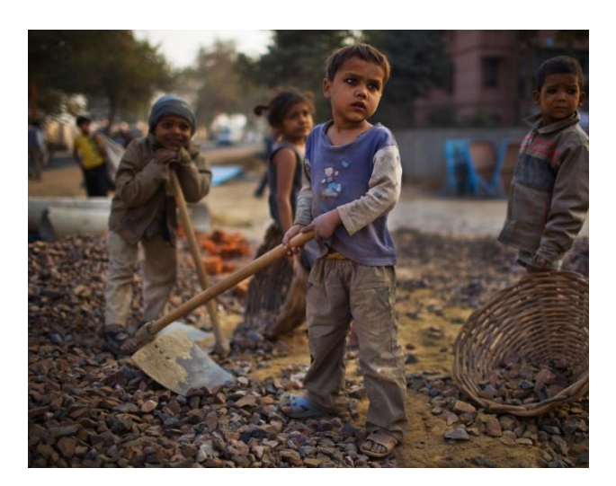
Figure 2. Indian children shoveling mine ore