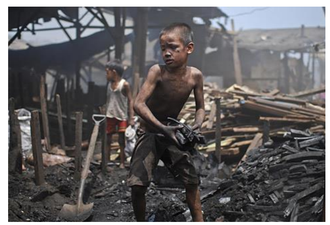
Figure 4. Filipino child laborers work in a charcoal dump, Manila, Philippines, 9 July 2012