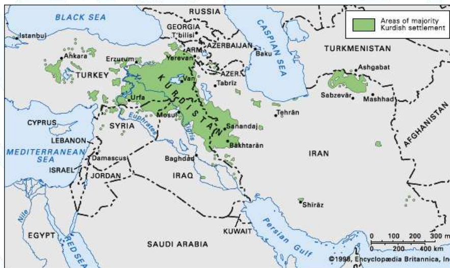
Figure 2. Proposed Kurdistan and other areas of Kurdish majority

With the largest Kurdish population and its own adherence to Western values, Turkish policy on Kurdish issues has been especially prominent. The rise of the insurgent PKK (Kurdistan Workers' Party or Partiya Karkerên Kurdistan), a communist-inspired Kurdish independence movement, greatly inflamed relations. War between the Turkish state the PKK began in 1984, killing some 40,000. With the capture in 2009 of the PKK leader Abdullah Öcalan and negotiation of a ceasefire in 2013, tensions have reduced, but the conflict is not over.