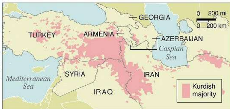
Figure 1. Distribution of Kurdish population

For the United Nations, Kurdish issues are difficult. The international community has a commitment to national self-determination and protection of human rights. It also serves the will of its 193 member states. When those rival priorities come into conflict, everyone involved must struggle to find the best possible outcome.