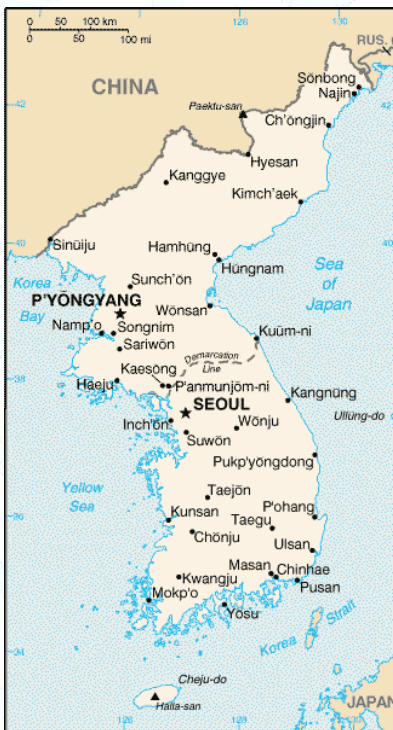
Figure 1. DRPK (North Korea) and ROK (South Korea)

The threat of unrestrained nuclear proliferation led to the negotiation of the Nuclear Nonproliferation Treaty (NPT) in 1968, which came into force in 1970. The NPT is reinforced by the 1995 Nuclear Test Ban Treaty (CTBT), which has not come into force, largely because the United States refuses to ratify it. The NPT, CTBT and associated trade controls make up the Nonproliferation Regime, the system of treaties and, agreements and domestic law designed to slow the spread of nuclear weapons capability. Nuclear weapons have helped bring the world's