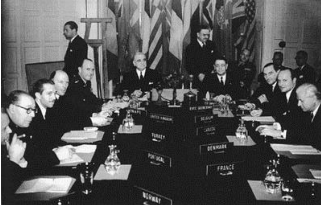
Not a simulation: negotiating the NATO Treaty in Washington, 1949