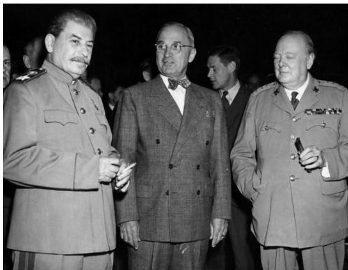
Stalin, Truman and Churchill meet in Potsdam, Germany, July 1945

By the end of summer 1945, Allied forces led by Britain, China, the Soviet Union (USSR) and United States, had defeated Nazi Germany and Imperial Japan. The close of the war reached a crescendo on 6 and 9 August 1945 when the United States demonstrated the destructive power of atomic weaponry, killing a combined 140,000 people in a flash. With occupation forces invading from east and west, Europe was divided into rival spheres of influence. The Soviet Union controlled most of Central and Eastern Europe, which included Bulgaria, Romania, Czechoslovakia, Hungary, Poland, and the eastern third of Germany (including half the divided city of Berlin). By 1947 sympathetic Communist Party governments were in control of all these countries. The countries of western and northern Europe remained largely democratic and aligned with the United States, as were non-democratic Greece, Iran, Portugal, Spain and Turkey.