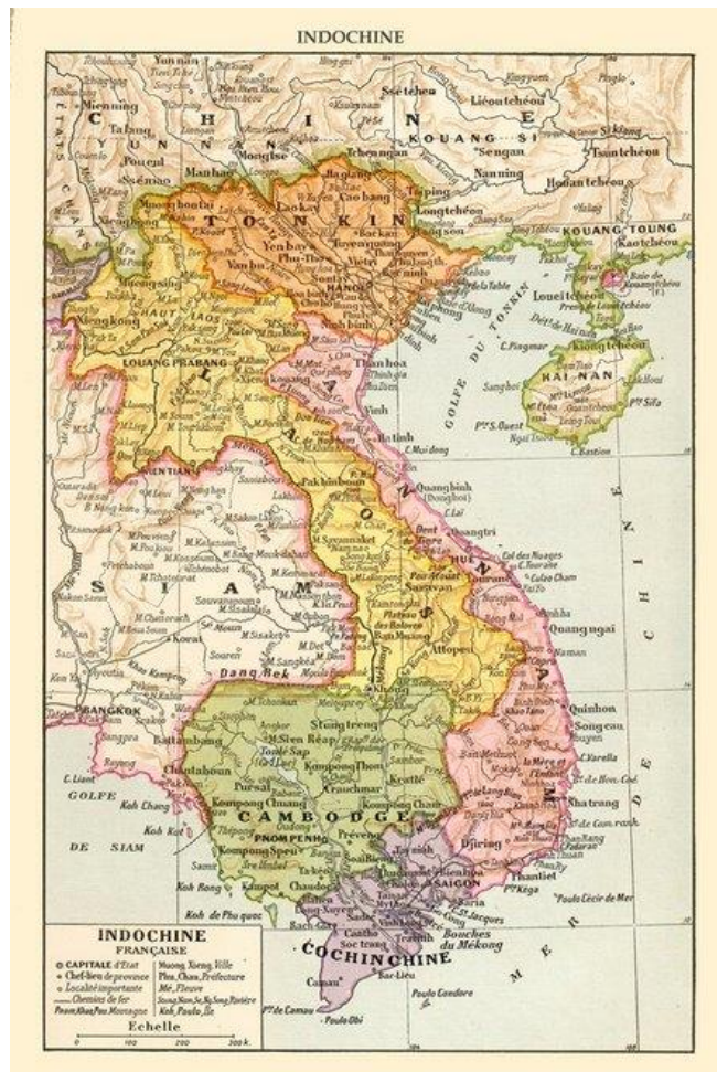
Still part of France: French Indo-China (Cambodia, Laos and Vietnam—as three provinces)

It's important for members of this committee to remember that the future is unknowable and other unpredicted events will happen, and it is up to this body to respond to them.