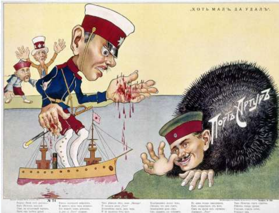
Figure 2. Russia enjoys the opening stages, while China and America watch helplessly