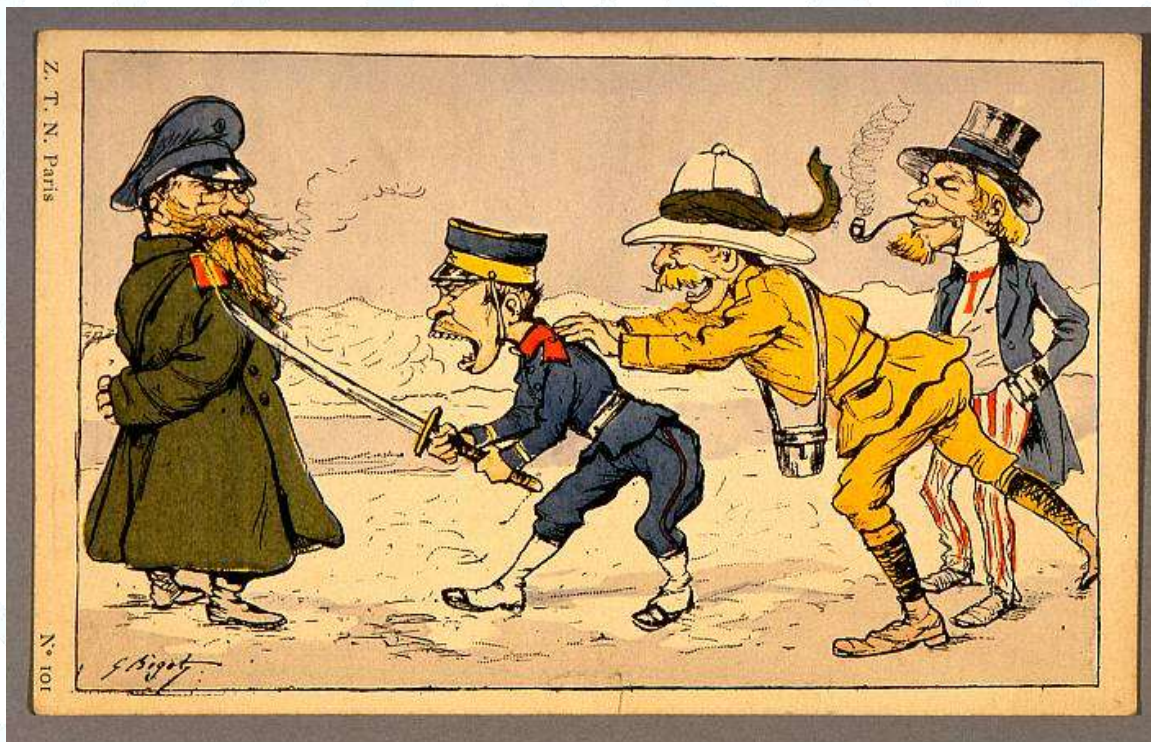
Figure 3. Britain supports Japan, while America calmly watches

Sir Ian Standish Monteith Hamilton - Quartermaster-General to the Forces - Though not a member of the Japanese Military, Sir Hamilton held esteem among his Japanese counterparts as a successful naval officer from an allied nation, operating as Quartermaster-General to the Forces in nearby India. As tensions grew between Russia and Japan, Hamilton's expertise in Western strategy was becoming an important resource to his allies.