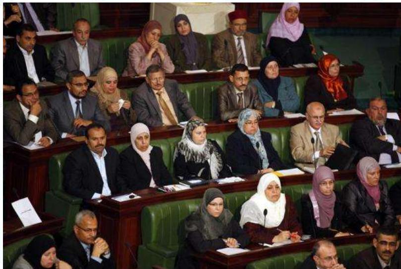
Figure. Women in the Tunisian Parliament-, 23 November 2011

Not all NGOs agree on proposal like Parliamentary Representation and Observatories. Some maintain that women really need provision of fundamental human rights, above all access to food, water and basic social services. In other words, women benefit disproportionately from basic economic development, and that should be the first priority of the international community.