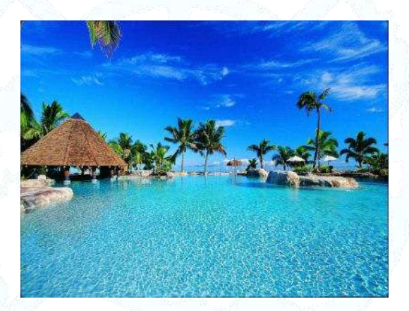
Fiji leads Pacific Island adaptation

While Egypt has used antagonistic rhetoric attempting to distance themselves from Western powers, the leaders usually support policies that align with Western powers. Egypt has kept its peace with Israel, supports democratic governments in the Middle East and Africa, and has strong trade relations with the EU, Italy, the US, and the Middle East. In Africa, Egypt is not a dominant power, but its population and wealth often sways viewpoints on African matter. Egypt's biggest issue in Africa is illegal immigration from unstable and poor nations to its South. In the Middle East, Egypt is forging alliances with its neighboring countries to become the dominant voice in the region. Egypt is openly hostile with Iran, but comfortable with Saudi Arabia and Turkey.