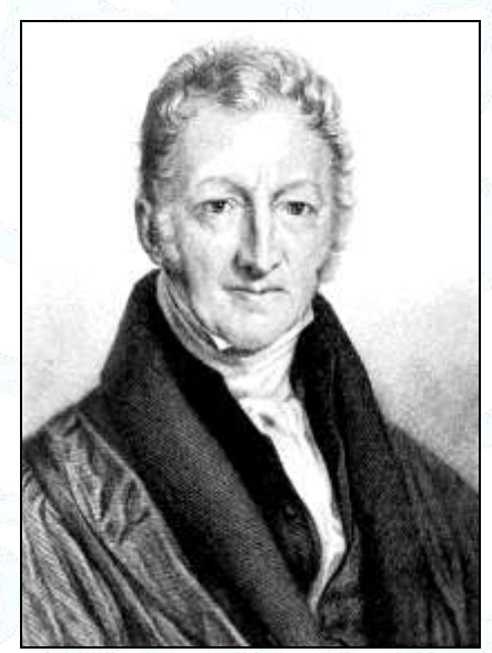
The Reverend Thomas Malthus (1766 –1834)

These transformations raise the specter of Malthusian crises, named for the Eighteenth Century English parson and mathematician who first identified the tension between rapid population growth and the slower growth in resources availability. Such crises were avoided in the Nineteenth and Twentieth Century, by bringing new land under cultivation, more efficient agriculture, and exploitation of fossil fuels. This approach seems increasingly unsustainable, as the mechanisms that allowed for the survival or growing populations increasingly undermine the environment and climate, endangering future generations.