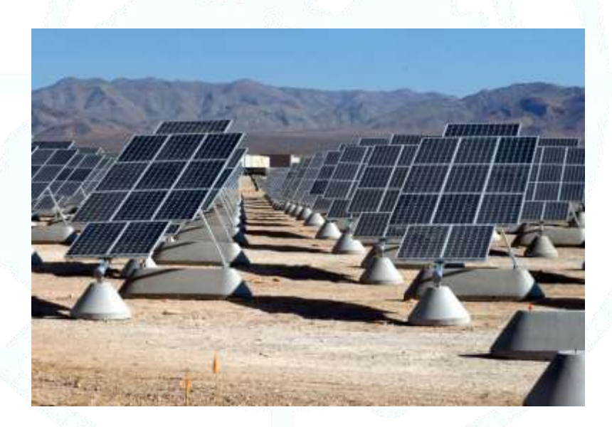
One of 8,667 solar panel farms owned by Reagan Solar Electric Inc.

industry's capacity, in 2015 the U.S. Congress passed the Free Flowing Energy Act to eliminate all state and local barriers to fracking and all other experimental methods of crude oil and natural gas collection. The majority of the gas and oil recovered has gone into the automobile market as additional efforts were put into developing the "alternative energy" sector. New fossil fuels are expected to keep the country import free until the mid-2040s. The United States has almost accomplished this goal by following much of the groundwork laid out by Germany as it became a nation powered by renewable energy. In the United States, solar energy is entirely privately owned, and Reagan Solar Electric Inc. has become a dominant force in Southern and Southwest politics. Solar fields were built in a number of deserts in the western United States as well as wind farms around the country and geothermal power plants where possible.