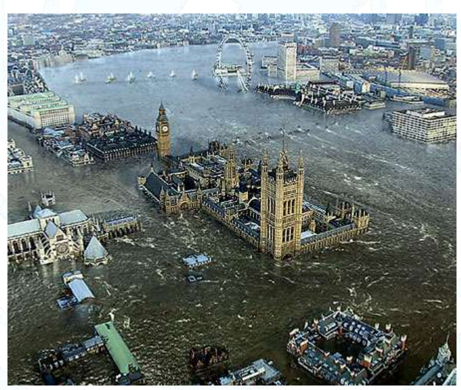
Sea-level rise: London during the 2031 Spring Flood. Prime Minister "It could; have been worse!"

Sri Lanka: After recovering from the civil war that ended in 2009 and the rise of authoritarian rule immediately after, the island country has slowly been moving towards unification and democracy. In 2014, they voted upon a new constitution which gave a significant amount of autonomy to the Tamil region in the east and north. Since then, relations between the two groups have moderated and many of the former tensions have died down. Improving relations allowed Sri Lanka to develop deeper relations with India. Sri Lanka has also been heavily affected by climate change. The effects of the 2004 tsunami are still felt. Although the government tried to move reconstruction in-land, poorer people continue to live in highly vulnerable, often flooded regions. They frequently receive a heavy amount of rainfall causing flooding and damage to their underdeveloped infrastructure. Economically, the country is still very poor and struggling to develop industry. Sri Lanka has been courted heavily by china, its leading investor. But ethic and cultural ties to India also are important. Sri Lanka needs to keep Chinese investment, but also needs to maintain good relations with India.