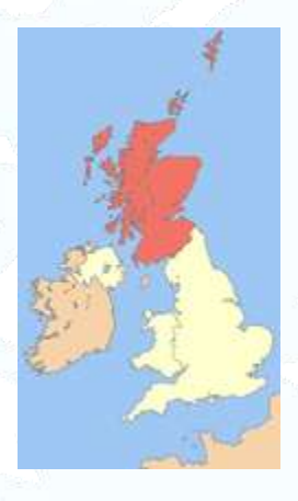
The UK in 2033

United Kingdom: Despite the independence of Scotland after the referendum of 2014, the United Kingdom saw much success while the rest of Europe faltered as they struggled to maintain the Euro. The stability of the United Kingdom's pound has allowed them to make headway in the shift to renewable power. Financial reassurance allowed the nation to follow the United States and adopt Germany's exemplary model of energy transition. Economic growth resumed in the late 2010s, fueled by immigration from Eastern Europe and the Caribbean. Nuclear power remains extremely important for the reduced United Kingdom of England, Northern Ireland and Wales, but conservation and massive investment in public transportation have had a major effect too. Experimental success has been seen in the establishment of Gulf Stream turbines to the northwest of the British Isles which constantly generate energy harnessed by the Gulf Stream.