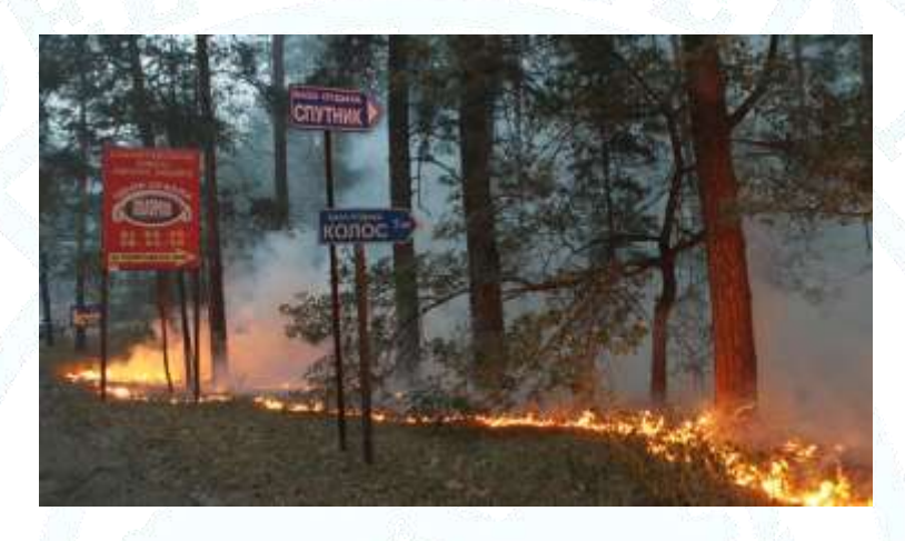
Russia: forest fires during the 2029 drought

Old Dominion University, Model United Nations Society