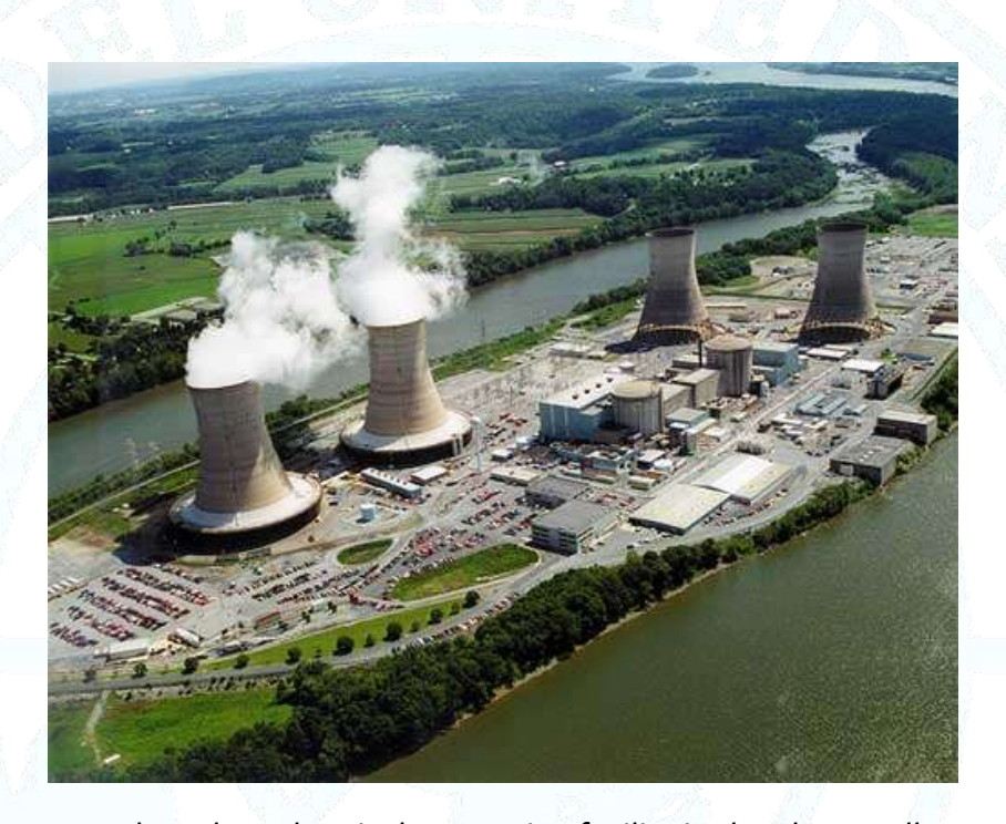
French nuclear electrical generation facility in the Rhone valley

Old Dominion University, Model United Nations Society