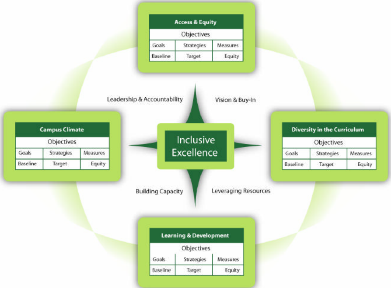
Figure 2. Inclusive Excellence Scorecard framework