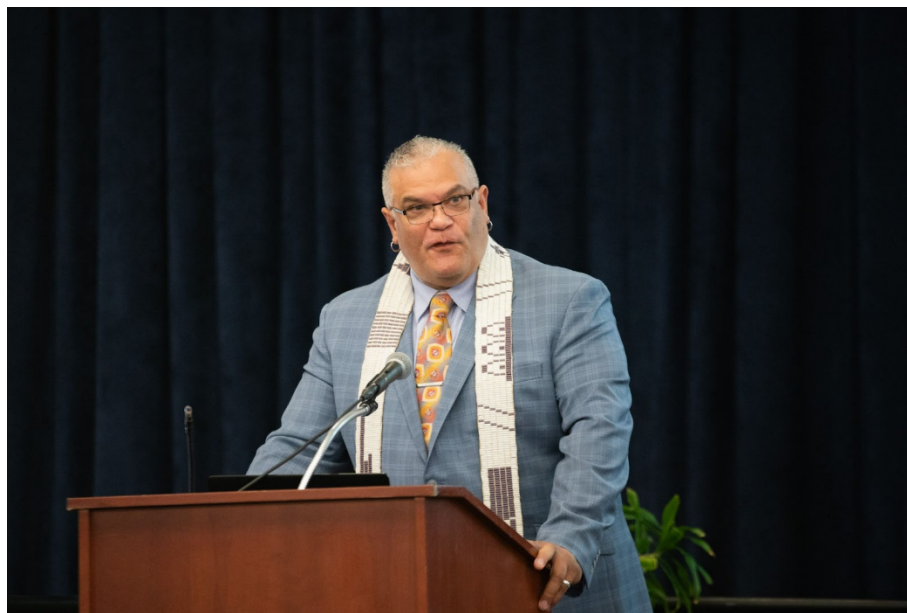
Picture of the Chief of the Nansemond Tribe

Our major initiatives included two CommUNITY Conversations . The first was held November 10, 2022, to highlight Native American Heritage Month. The Office of Institutional Equity and Diversity partnered with The College of Arts & Letters' English Department, Norfolk State University, and the Virginia Tribal Education Consortium (VTEC) to hold the first ever land acknowledgement symposium on campus. "This is Tsenacomoco: A Native American Land Acknowledgment Symposium" brought together interdisciplinary academics with members of the Nansemond and Chickahominy tribes to discuss the rich and complex histories of the land on which ODU and NSU presently stand, the intricate relationship that indigenous peoples have with the land, and the importance and role of land acknowledgements at institutions. On hand were two executive officers of VTEC (also alumnae of ODU) who also spoke directly to some of the educational concerns Virginia's tribes face, and the work being done by the consortium to add culturally competent and historically accurate information to the Commonwealth's education curricula. Over 100 people attended.