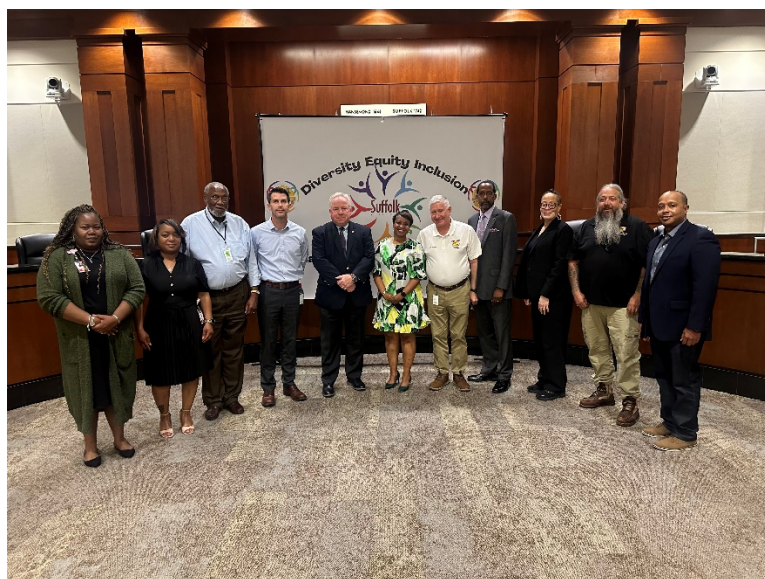
Members of the DEI Committee and Suffolk City Council