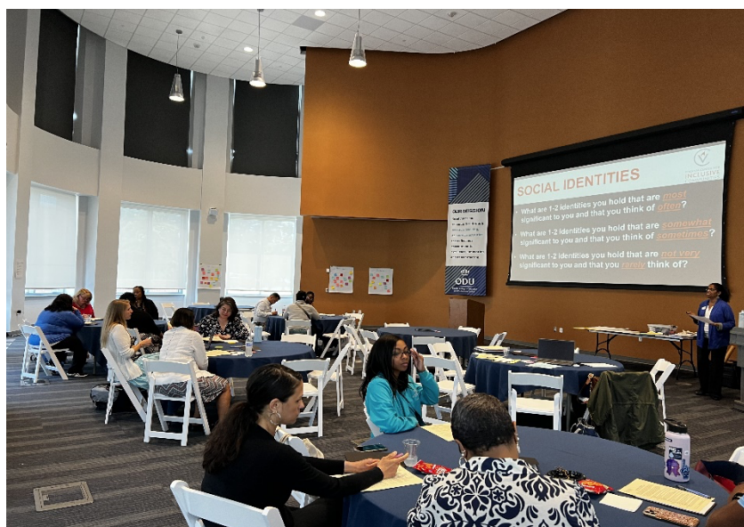
Picture of people having small group discussion on the topic of social identities.