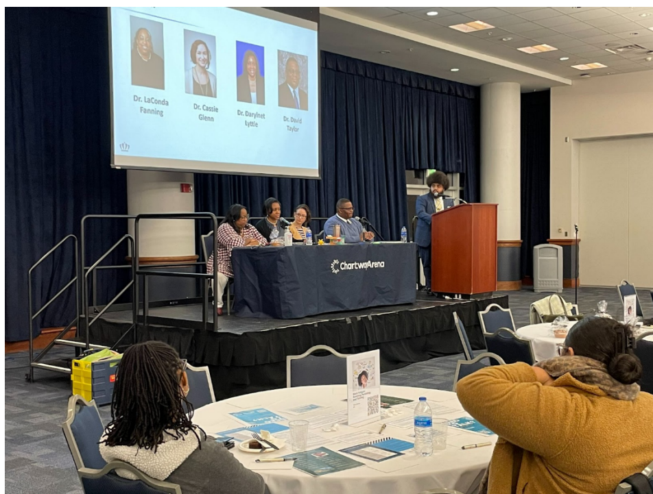
Picture of participants and panelist

CommUNITY Conversations have become a staple at ODU. As the University grows and looks toward the future, the MFTIE hopes to elevate and expand this platform. We’re building an inclusive community, one conversation at a time!