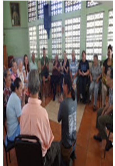
HMSV Students visited and danced with the Residents at the Retirement Community

Upcoming study abroad trips in the Counseling and Human Services department are announced to all Counseling and Human Services students via email, on the department’s website, the Study Abroad website, and through personal announcements in the residential courses.