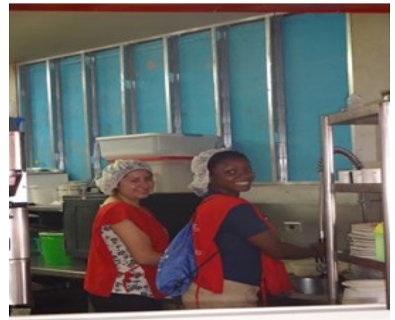
HMSV Students served at the Catholic Orphanage where they did crafts, read with the children, and helped in the kitchen.