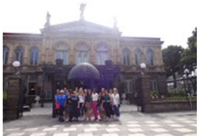
Human Service Students and Faculty Toured Costa Rica in Spring Break 2014